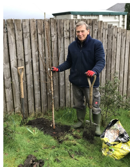
Right: Finally, the Editor's contribution, a Conference Pear Tree.