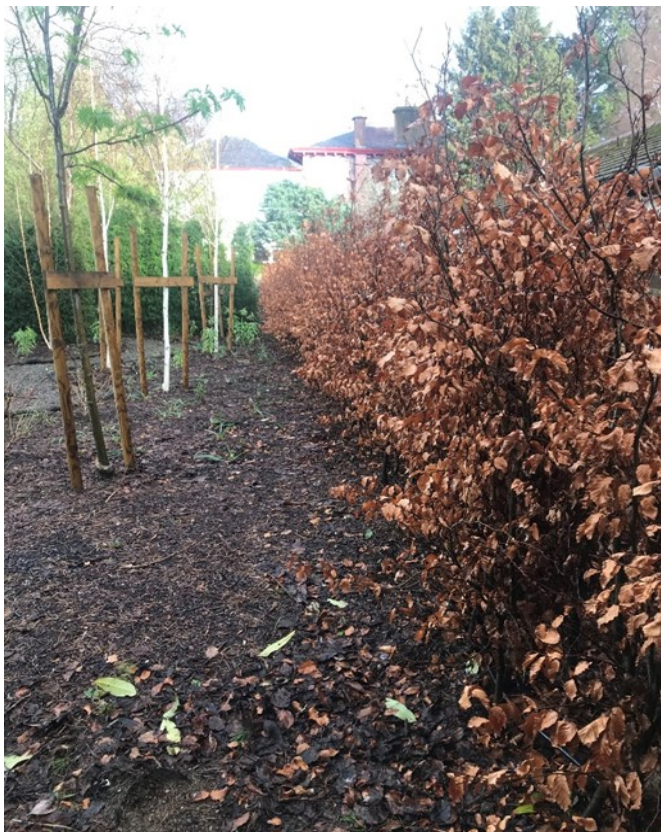
The same beech hedge in April 2022, now established

In addition, we planted English Yew trees ( Taxus baccata ) in a dense formation to create a garden room for our vegetable plot. The dense evergreen habit of the Yew is not only very architectural but acts as a lovely voile for other garden features. It is also the adopted plant badge of the Clan.