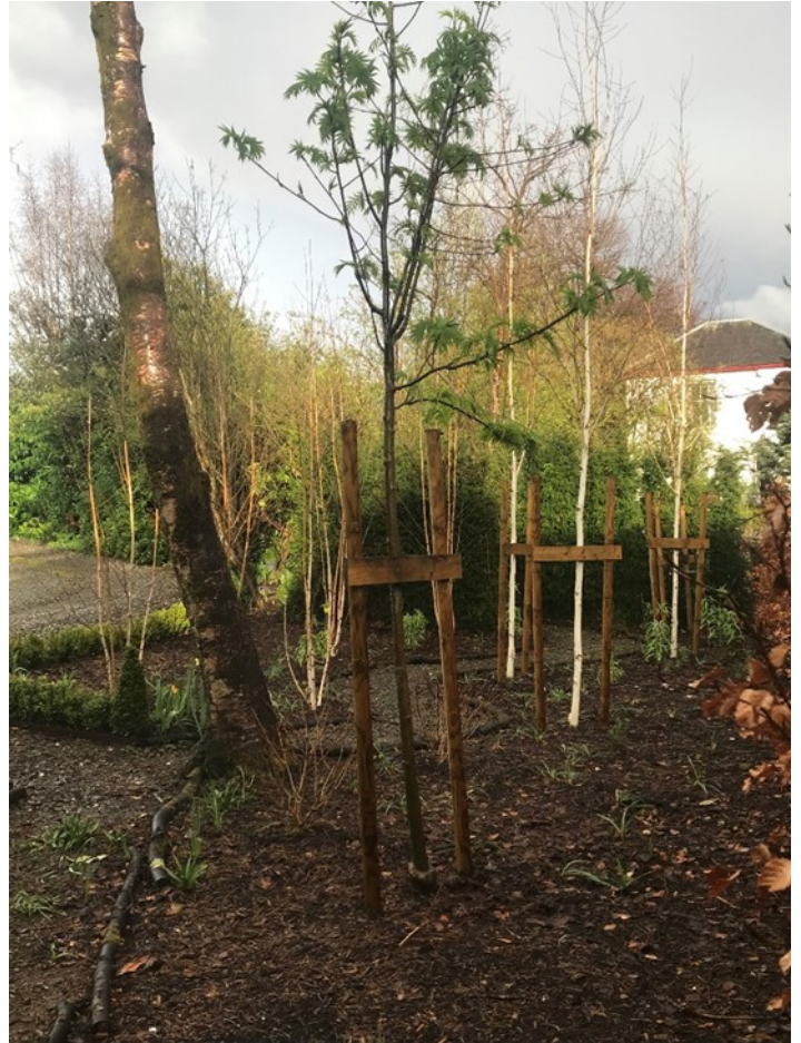
The ghost-white stems of the fastigate silver birches ( Betula utilis jacquemontii 'Doorenbos') with a Sorbus 'Olympic Flame' bursting into leaf in April 2022

In another section of the garden we planted a trio of ornamental weeping cherry trees ( Kiku Shidare-Zakura ). Backlit in the spring by the red blousy flowers of a camellia hedge ( Kramer's Supreme ), the vibrant pink blossoms and drooping habit of these trees create an interesting feature in what is a more formal area of the garden. Helensburgh is famed for its cherry blossom-lined streets in the spring, so the choice of such a floriferous cherry blossom in our garden reflects a long-standing tradition in the local area.