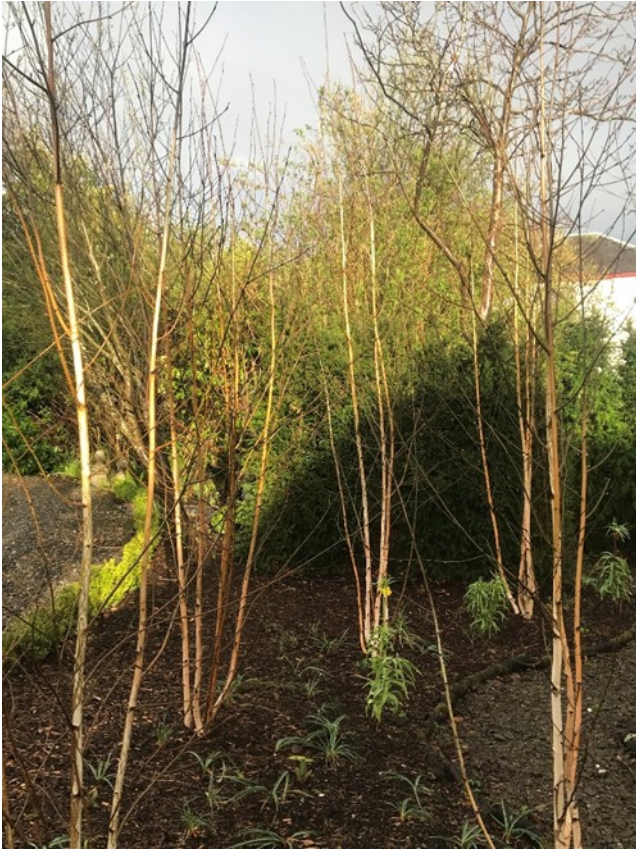
Multi-stem silver birch trees ( Betula utilis jacquemontii 'Doorenbos') lining the woodland walk in April 2022.