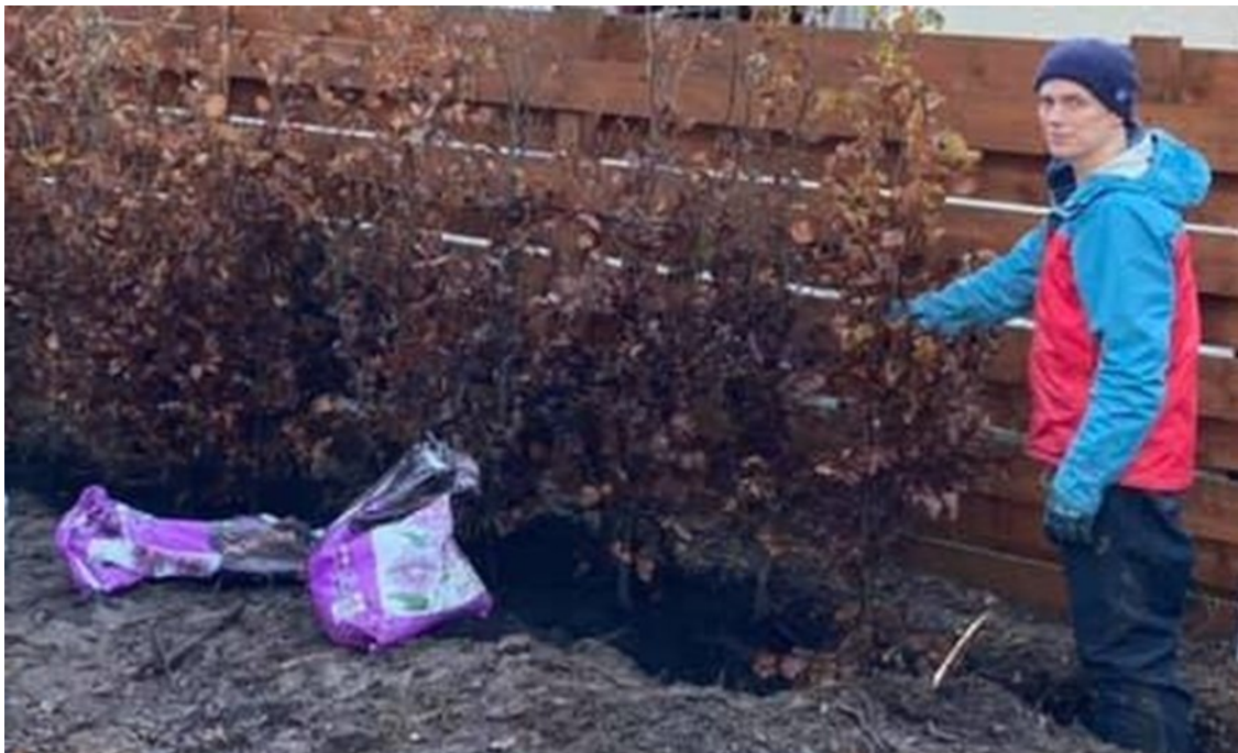
Planting the beech hedge in winter 2020-21.

Approximately 160 plants went into creating a beech hedge to mark the property boundary. Beech ( Fagus sylvatica ) are a common native tree in western Scotland and create a valuable habitat for insects and small song birds as well as acting as a convenient privacy screen when trained into a hedge.