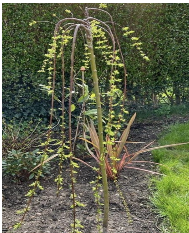
Thea, another Society member sent in her contribution from Milton Keynes, Buckinghamshire, but on a much smaller scale. This is a Waterfall Willow, Salix integra pendula waterfall. It's a dwarf tree only reaching 1.5m in height and spread over 10 years. So a perfect tree for a smaller garden.

Whether as instant impact or with an eye to the future, we've found tree planting a very rewarding experience, one which we'll hopefully benefit from for many years to come.