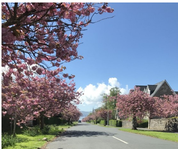
Above: The famous cherry blossom-lined streets of Helensburgh