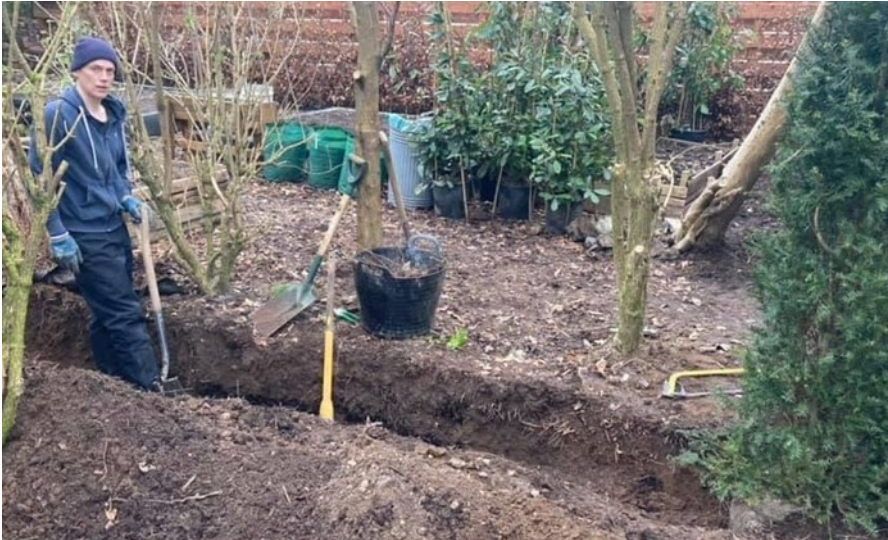
Left: Planting the Yew Garden 'walls' in early 2021.