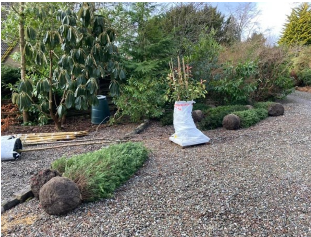
Taking delivery of different tree species in early 2021

For the past two years, we've undertaken a large-scale tree-planting operation as part of a garden redesign project. Our aim was to plant native or naturalised tree species where possible, as well as create schemes which would reflect the local flora vernacular.